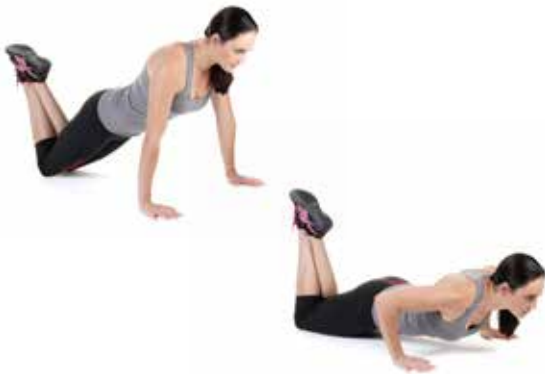
1 Ladies Push Up 3 Sets, 8 Reps