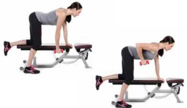
4 One Arm Dumbbell Row 3 Sets, 10 Reps per arm