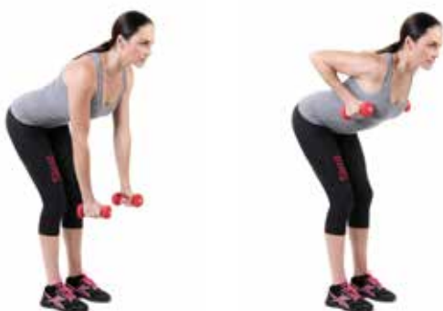
5 Bent-Over Dumbbell Rows 3 Sets, 10 Reps