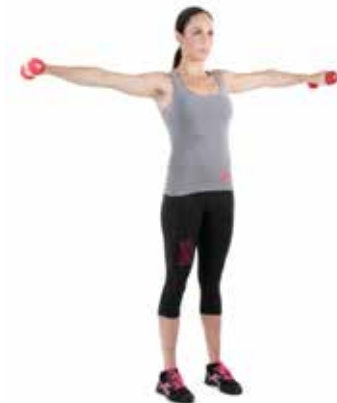
3 Lateral Hold 3 Sets, 30 Seconds