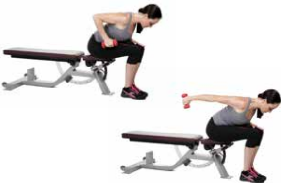
9 One Arm Bent Over Extensions 4 Sets, 15 Reps per arm