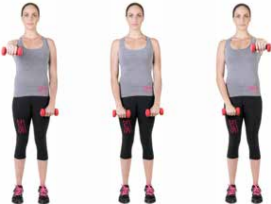
3 Front Raises 4 Sets, 10 Reps per arm