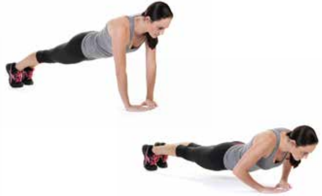
8 Diamond Push up 4 Sets, 10 Reps