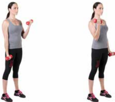
5 Standing alternating Hammer Curls 4 Sets, 12 Reps per arm