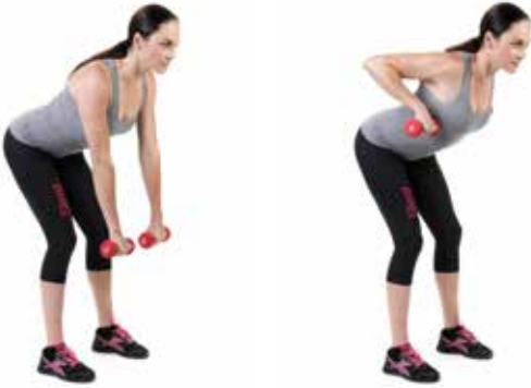
3 Overhand Grip Bent over Rows 5 Sets, 12 Reps