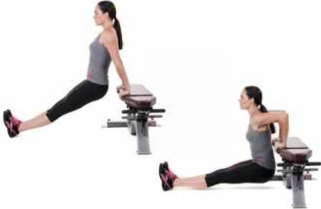
7 Bench dips 4 Sets, 15 Reps