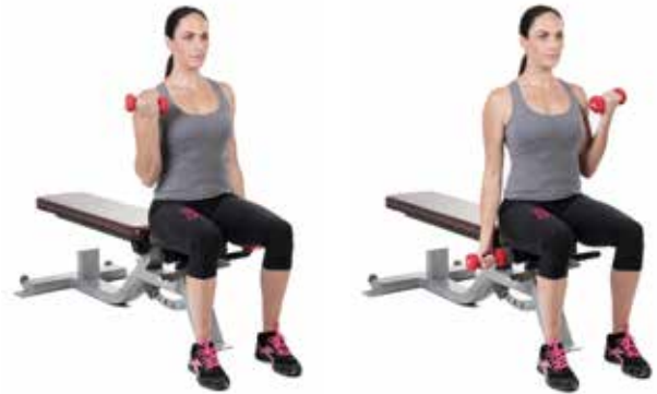
4 Seated alternating Dumbbell curls 4 Sets, 10 Reps per arm