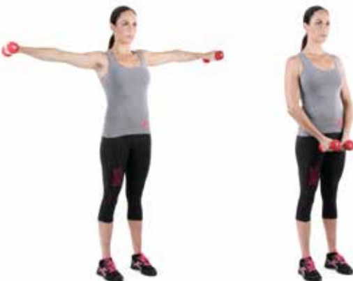
5 Lateral Raises 4 Sets, 15 Reps