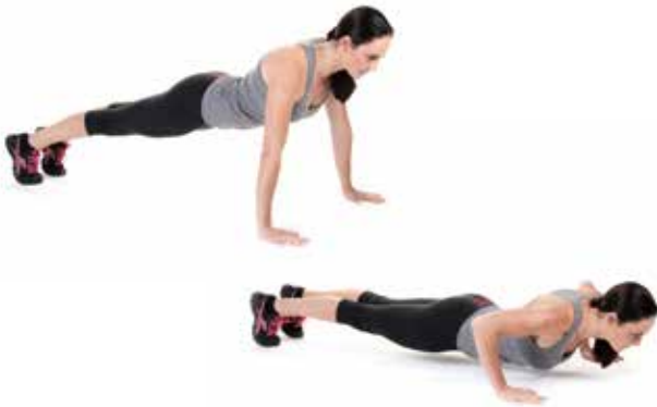
1 Men's Push Up 4 Sets, 15/12/10/8 Descending Reps