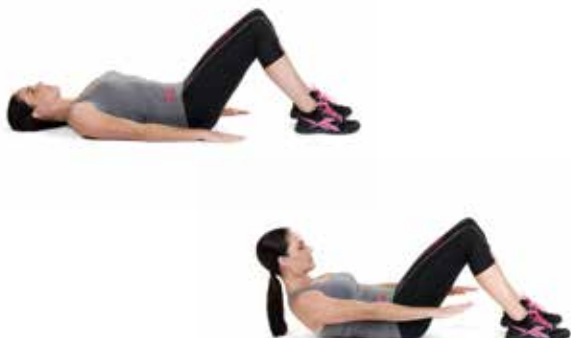
1 Crunches 4 Sets, 20 Reps