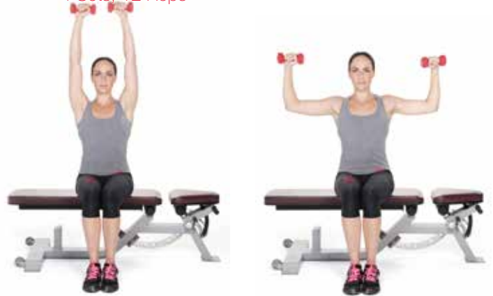
2 Seated Military Press 4 Sets, 12 Reps