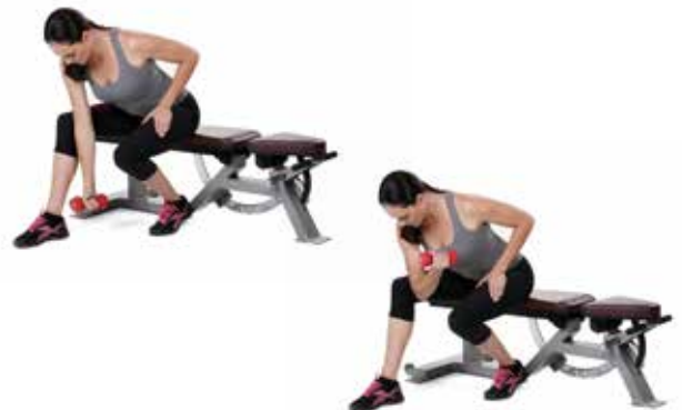
6 Seated Concentration Curls 4 Sets, 15 Reps per arm