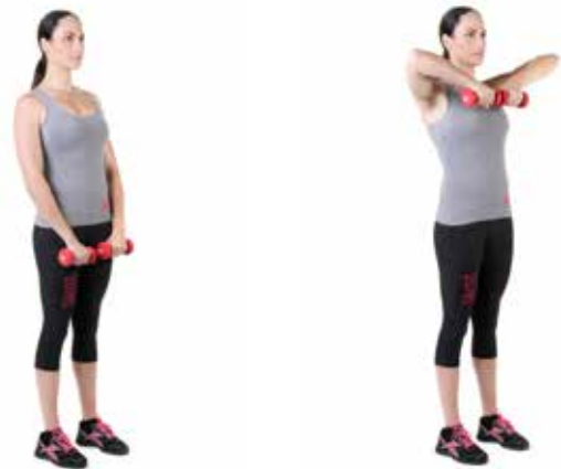
4 Upright Rows 4 Sets, 15 Reps