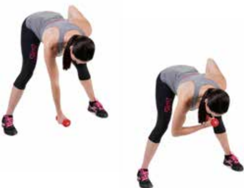
7 Hanging Concentration Curls 4 Sets, 8 Reps per arm